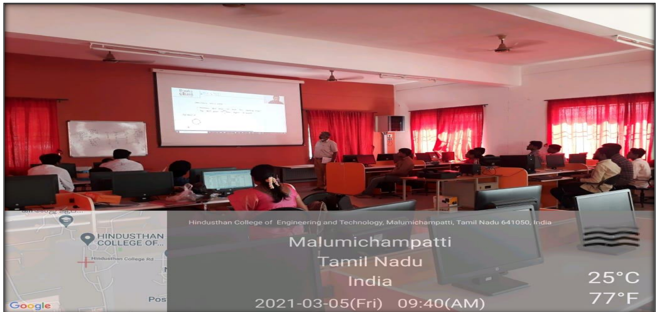
ICT FACILITY IN LABORATORY