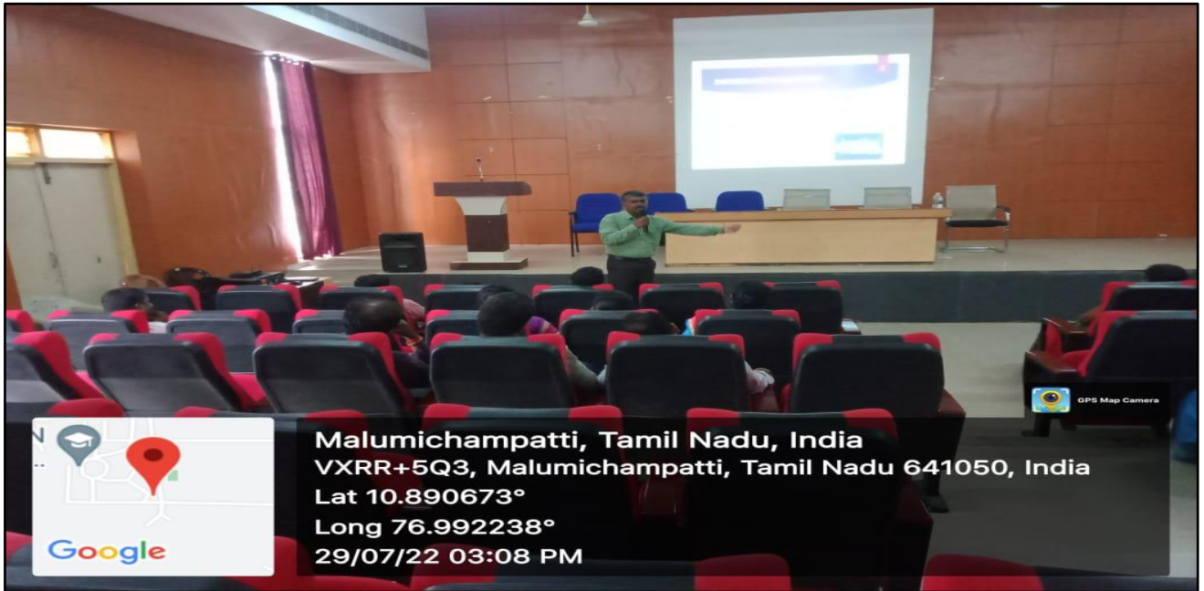
ICT FACILITY IN SEMINAR HALL